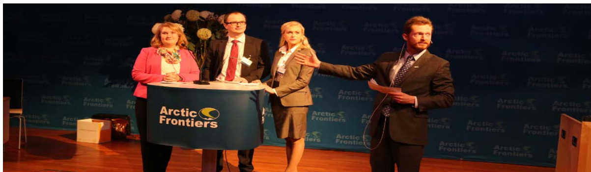
THE EMERGING LEADERS PRESENTING AT ARCTIC FRONTIERS 2013